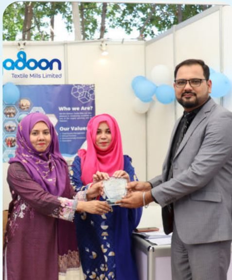
@ ICMA Pakistan