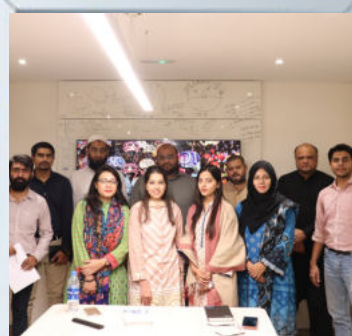
World Human Rights Day (Awareness Session)