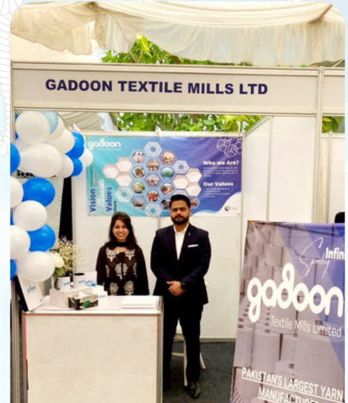
@ SZABIST University