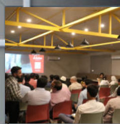
T-20 Semi Final (Live Screening)