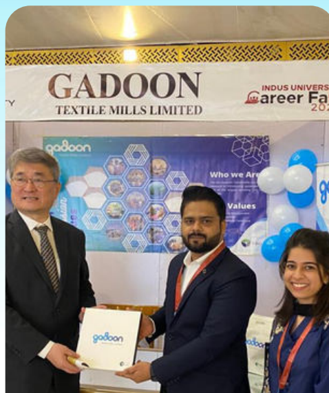
@ Indus University